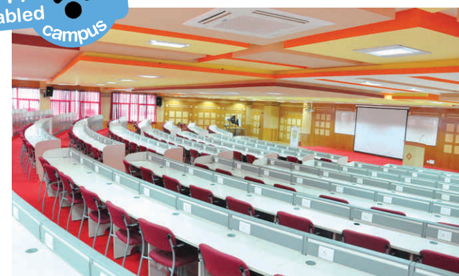
Smart Class Rooms